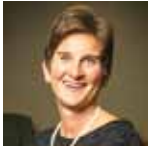
Mayor Pro Tem Sally Russell