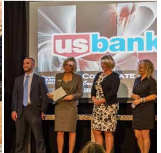
More Bend Chamber SAGE Business Award photos available at www.BendChamber.org/events