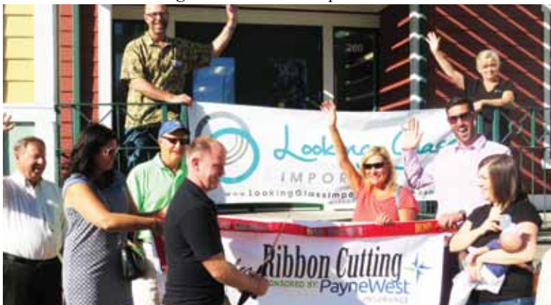
Ribbon Cutting at Looking Glass Imports & Cafe