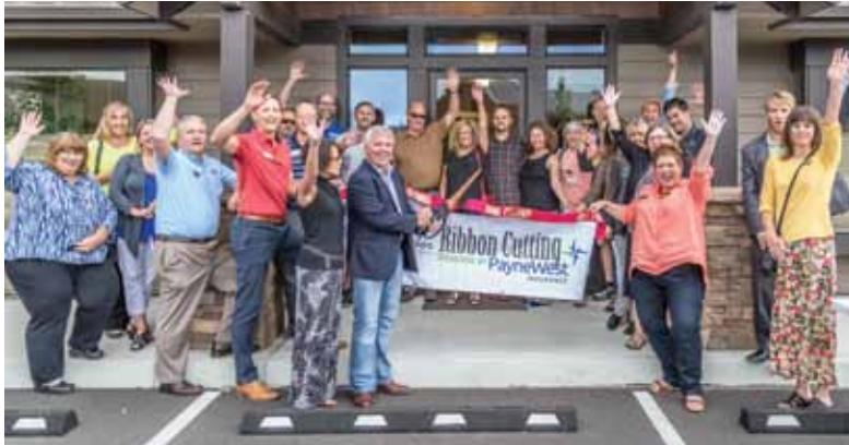
Ribbon Cutting at CrossPointe Capital - C12 Cascades