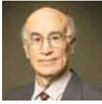
Mayor Jim Clinton